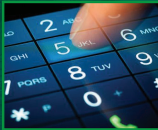
Control Access with a simple push of a button on your touch-tone telephone