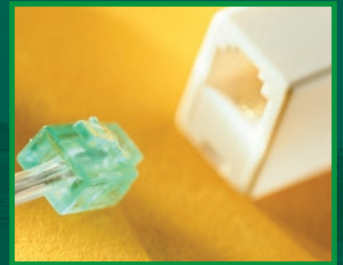
No Central Office Necessary just plug a touch-tone telephone into the apartment phone jack