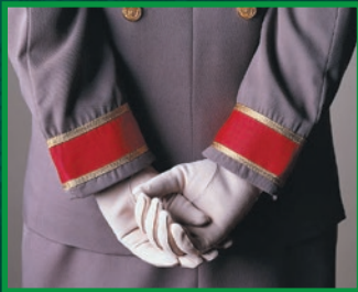
Doorman Telephone inputs for high-rise apartment buildings

APARTMENT COMPLEXES • MIXED USE CONDOMINIUM/RESIDENT HALLS • COMMERCIAL